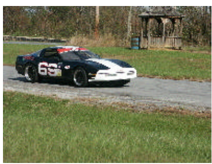
MIKE GEYER Cranking out of last turn on Saturday.

Complete results of the Spooktakular inside starting on page 11 !!