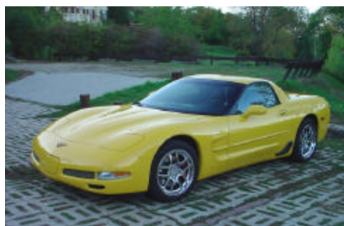
Todd's 2002 Z06 in Budapest

Next time you are going out "sportin'" try it in this Limo!! NOT FROM BUDAPEST!