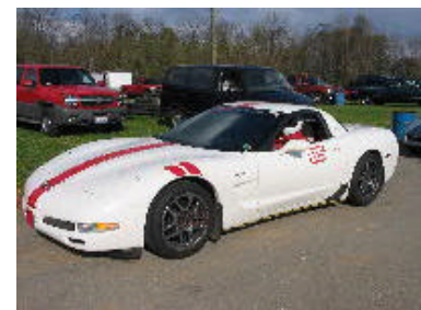
Brian Gallagher's 3MH