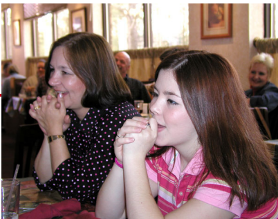
from Hopsfrog brunch or Rallye 101