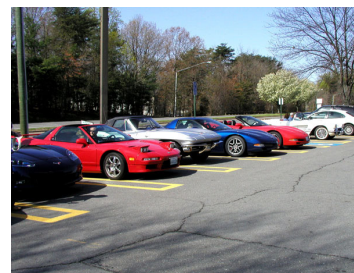
Funny red furrin car doing next to the good looking C2?