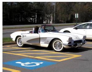
Rallye Master for Rallye 101 Cool '61—C1