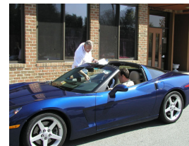
C6 in Rallye