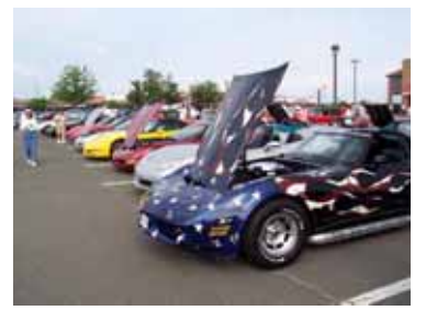
NVCC Line up at the Cruise In

NORTHERN VIRGINIA CORVETTE CLUB Website: WWW.nvcorvetteclub.com