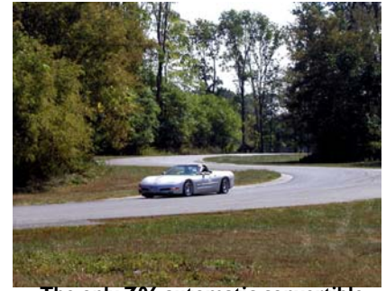
The only Z06 automatic convertible that I know