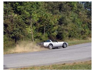
Shortcuts not allowed!

We took a long lunch break to give everyone a rest and finished up well before 4 o'clock. Then it was off with the numbers, pick up the cones and timing gear, cleanup, put the street tires back on, help get cars on trailers, tools put away, and get ready to head home. One of the great things about this time is all the compliments the NVCC receives from non-club members. It makes it all worthwhile as the hosting club that everyone takes the time to thank the club workers.