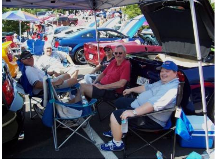
The Refreshment Guard