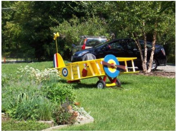
Obviously the traffic was bad enough at Clifton that some celebrities flew in.