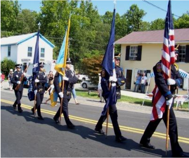
The Color Guard