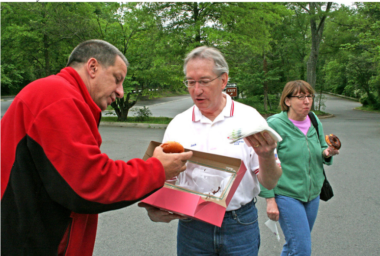
The traditional feeding of our President