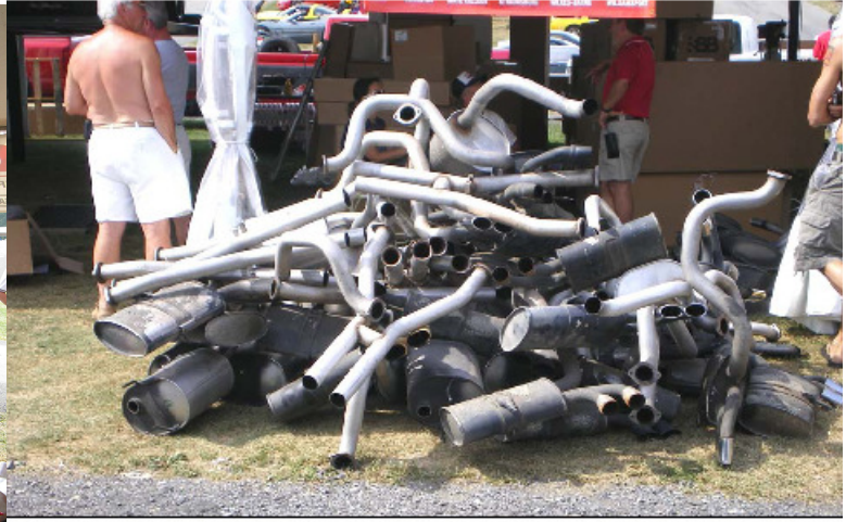
The bone pile from exhaust change outs (The corvette owners' contribution to economic stimulus)