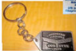
NVCC Keychains $10.00 ea

WARRANTY If the metal key chain is damaged due to the metal chain being a part of the original design, we will be happy to replace it with a new one. All charges, including shipping, will be paid with your return and address to: MARTINDALE, INC. P.O. Box 300 478 Industrial Parkway Chapel Hill, NC 27514