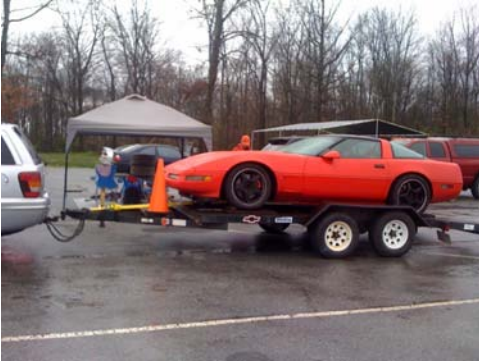
Rick's vette stayed put: