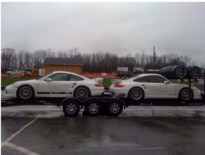
His and her turbo Porsches: