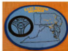
NVCC East Region Patch (Limited Qty Available)