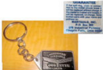
NVCC Keychains $10.00 ea