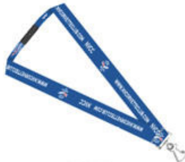
NVCC Lanyard $5.00 ea