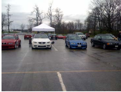
Der Bayerische Motoren Werke: