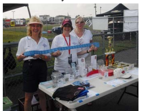
Our NVCC frontline for registration and ticket pushing (try to run this gate at extreme risk)