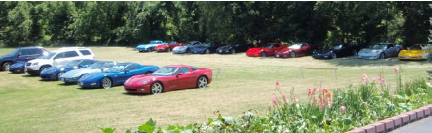
Vettes on the green above and the "main event" to the left in the NVCC's official picnic shelter (aka our 4-car carport).