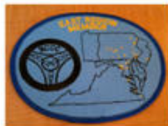
NCCC East Region Patch (Limited Qty Available)