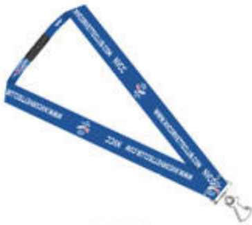
NVCC Lanyard $5.00 ea