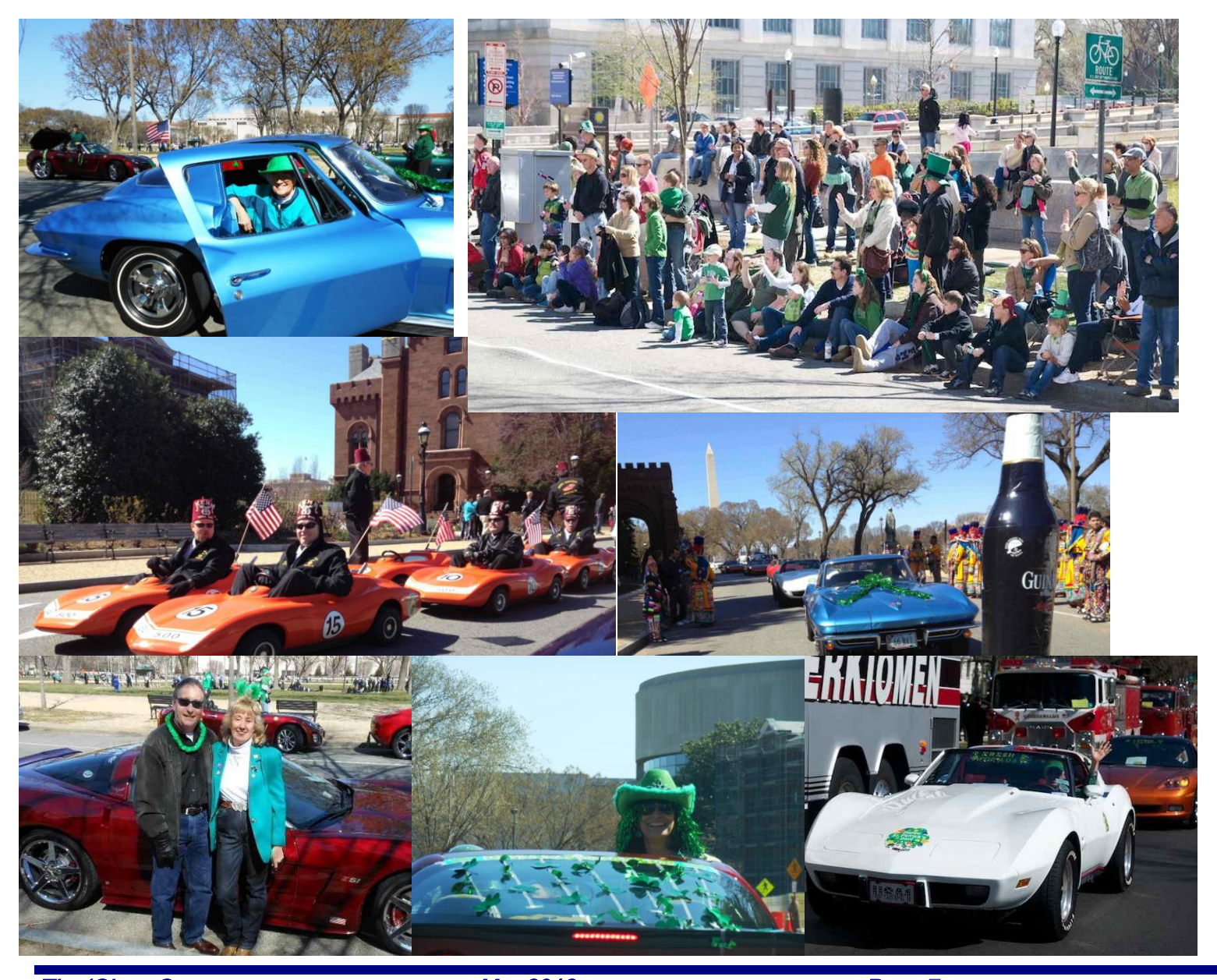
The 'Glass Gazette Mar 2012 Page 7