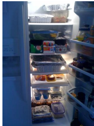
What 1 out of 3 refrigerators looked like before the picnic...