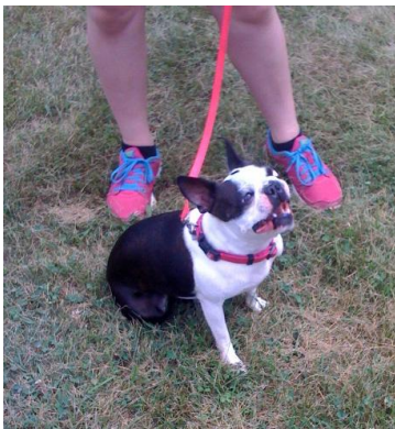
Happy Canine Picnic Guest...