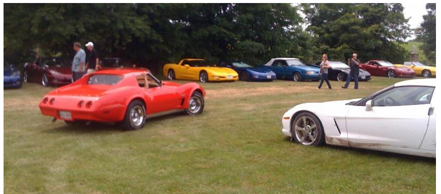
A colorful array of vettes on the Anderson lawn...