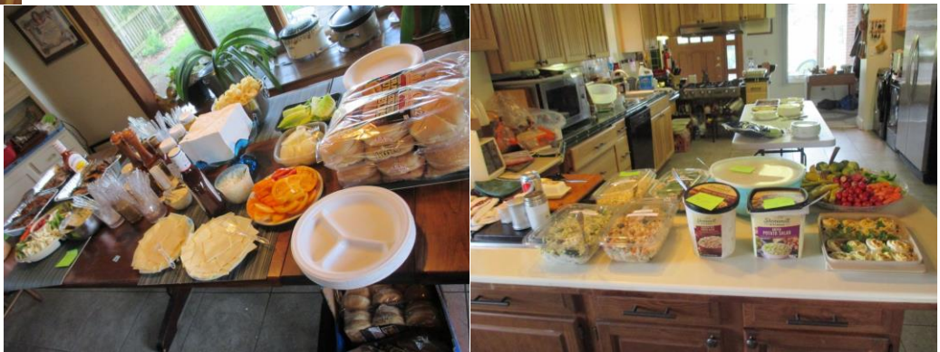
We had beautiful weather and a great turnout!