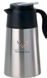
C7 Corvette Vacuum Stainless Steel Carafe