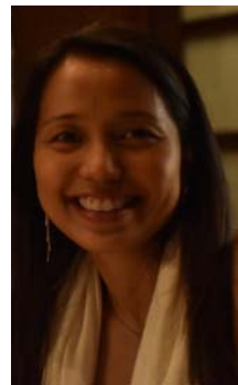
Social Media/Photographer Mae Fromm