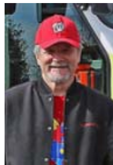
NCCC Governor Andrej Balanc