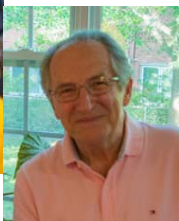
Store Tab Tabellario