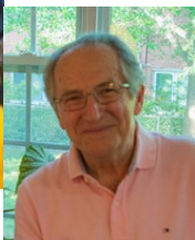
Store Tab Tabellario