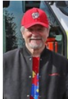
NCCC Governor Andrej Balanc