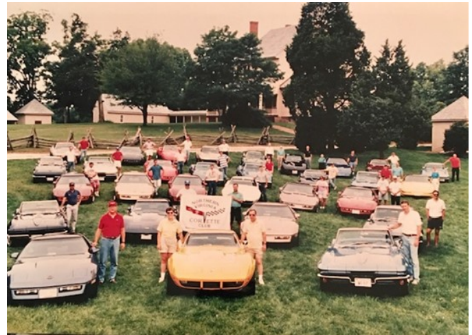
NVCC's 25th Anniversary (1994) Picture, Sully Plantation

Rosenthal Chevrolet was the sponsor of the NVCC. The salesman gave me a flyer about all the NVCC events...autocrossing, rallies, concours, cruise-ins, etc. I was so excited, I went to the June Council Meeting plus attended a cruise in at the Jukebox Cafe in Manassas, become a member July 1991, and the 21st president in January 1992.