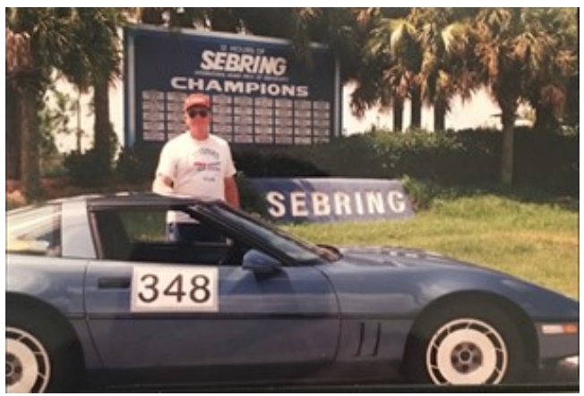
High Speed Autocross at Sebring Raceway

I thought a new Corvette was above my budget so I was looking for a Fiero GT. On the way to look at one, I passed Rosenthal Chevrolet at the corner of Columbia Pike and Glebe Rd. Their used car lot had two Vettes; 1984 and 1985 Coupes. I test drove both...the salesman riding with me hung on for dear life. The 1984 Cross-Fire V8 was not as peppy as the 1985 Tuned-Port V8 so the 1985 came home with me. Yes I was hooked but my first Corvette wasn't red or a stick....compromises. "When you want it, you want it now."