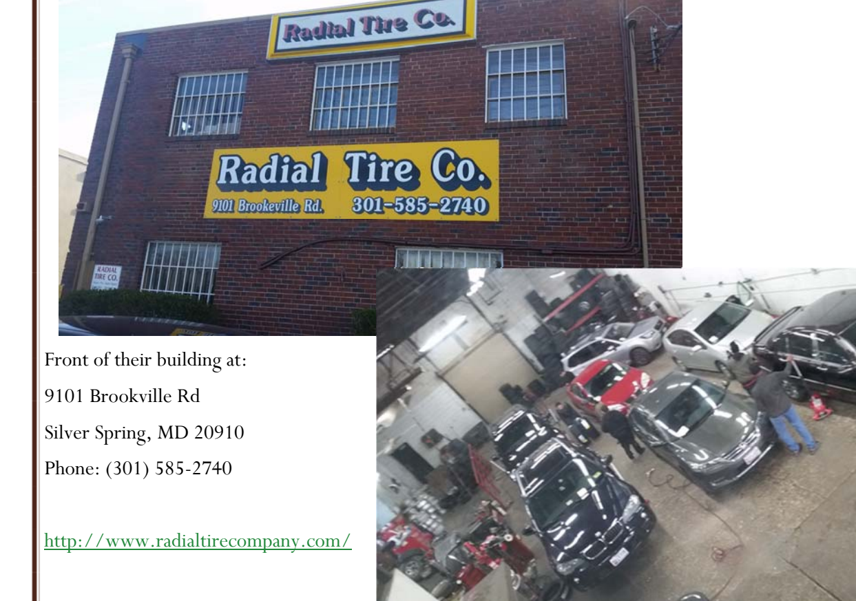
2nd floor waiting room. The red car is mine.