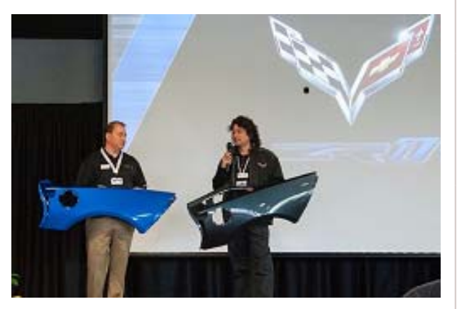
GS7 Elkhart Lake Blue (replacing GTR Admiral Blue) June 28: GTR Admiral Blue – Last Day to Order August 13: Last Day of Production August 30: GS7 Elkhart Lake Blue – Available to Order October 1: First Day of Production