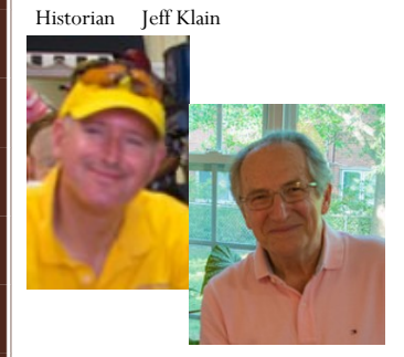
Store Tab Tabellario