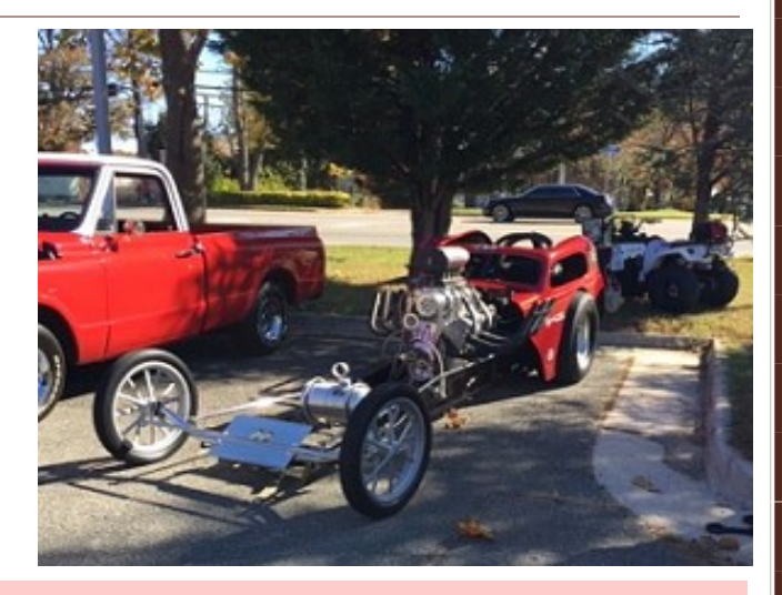
Hayfield Days - Annual Car, Truck and Motorcycle Show November 4, 2018

Hayfield Secondary School held their 11<sup>th</sup> Annual Hayfield days on a perfect day. The weather started out cool and warmed up enough to be comfortable. The cost to enter was $20, which supports the Hayfield Auto Tech Program.